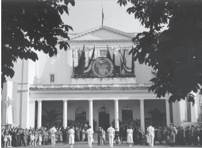
Beli dvor, 1955. god.

Josip Broz Tito je do 1956. godine štafete primao u Belom dvoru gde mu je uručivano više glavnih štafeta. 9 Sve druge štafete predate su Kabinetu Predsednika Republike. 10 Posle predaje