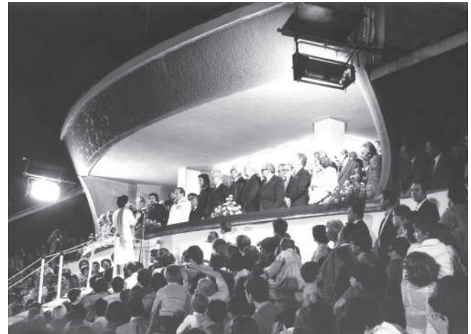
Stadion JNA, 1979. god.

Ideju da se štafetnim trčanjem prenosi palica u kojoj će biti čestitke za rođendan Josipu Brozu dao je Josip Prohaska, profesor fizike u Kragujevcu, koji je pre rata bio član