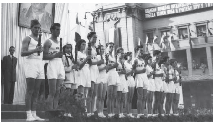
Trg Republike, 1949. god.

Organizovanje „Titove štafete” bilo je razgranato od škola, radnih kolektiva, mesnih zajednica do gradova. Sve ove štafete se „slivaju” u mesne; mesne štafete se „slivaju” u sreske, a sreske u republičke. U republičke se slivaju i mnoge štafete društvenih i sportskih organizacija: Saveza boraca, narodne tehnike, streljačke, planinarske, saveza za konjički sport, biciklističke, pionirske, vatrogasne, omladinske sa radnih akcija. 7 Vojska je organizovala štafete graničara, kopnenih snaga, vazduhoplovstva i mornarice. Cilj je bio da što veći broj mladih učestvuje u pisanju čestitki voljenom Titu , pripremi programa povodom dočeka i ispraćaja štafete, u njenom nošenju i pretrčavanju desetina hiljada kilometara da bi one, 25. maja, stigle u Beograd. Angažovanje što većeg broja mladih u masovnim sportskim manifestacijama bilo je dobar način političko-propagandnog rada za sve one koji nisu bili članovi KPJ ili SKOJ-a. 8