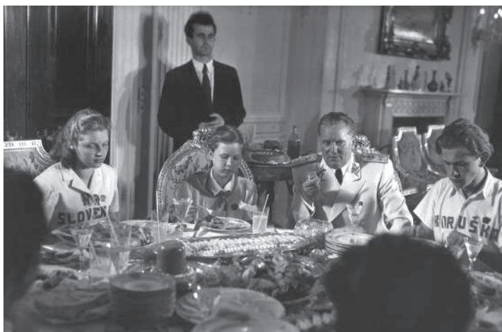
Beli dvor, 1949. god.

occasion of welcoming the baton and it was evaluated that they “retained somewhat conventional political character.” 21