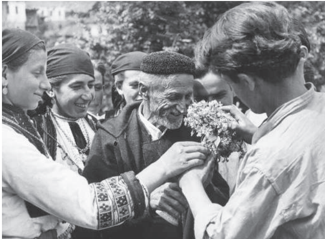
Titova štafeta, 1950. god.

Štafetom je najbolje manifestovana ideja zajedništva. Zamišljena kao opšte jugoslovenska manifestacija, predstavljala je sinonim za masovnost i raznovrsnost telesnog i duhovnog razvoja najšireg sloja građanstva, bez obzira na klasnu, versku i nacionalnu pripadnost. Primanjem, nošenjem i predavanjem