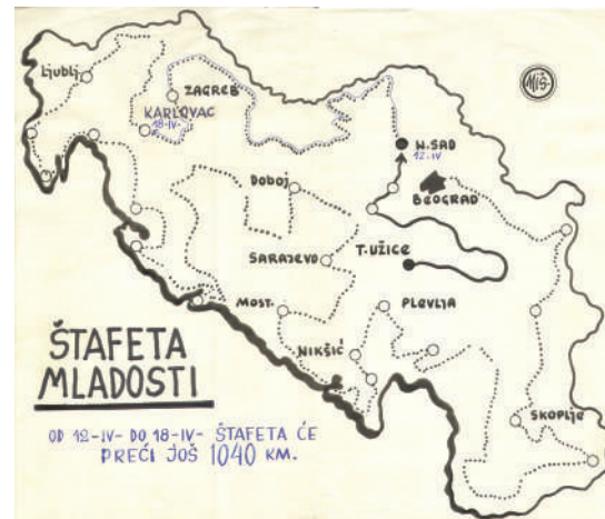
Putanja štafete, 1961. god.

competitions: racing of pioneers, 110-meter hurdles; 800-meter race; rope-skipping and hoop exercises; apparatus gymnastics; group exercises with rifles, etc. 17 Music was composed by Dušan Skovran and Bojan Adamič, among others. Over a time, the Rally changed in character and from sports manifestation turned into a musical and entertaining event. Every year with a new symbolic name, 18 program should “by its contents round up the whole in a spectacular way and to be the crown of the frame of mind and wishes of today’s young generation.” 19 The Celebration Board reconsidered the concept of the final performance every year, noting that “in constantly improving and building-up (in concept) it had reached such point when it should be decided whether to keep the present character of the performance (rally with artistic components) or search new ways and solutions in accord with the existing or new conditions...If we decide that the performance should become even more spectacular, inimitable, unique in us, one should endeavour to have it authorized to a larger extent than before.” 20 Remarks were expressed in respect of programs organized in individual cities on the