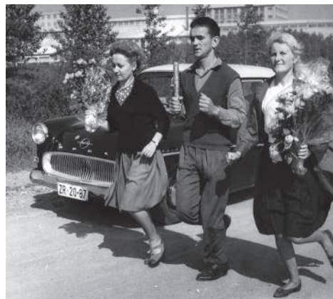
Štafeta mladosti, 1962. god.

However, climate in the society had changed and written messages acquired a note of pessimism; unemployment and falling standards of living were mentioned in them, and the rally of 1987 carried a provocative title “Switch on the Light”. There were debates about further destiny of the manifestation, Slovenian young people suggested an end be put to it, and the last Youth Relay Race in 1987 was accompanied by a scandal where even the Army and police were involved. The poster offered for the celebration of the Youth Day, concept of the design studio “New Collectivism” from Ljubljana, was in fact an altered German Nazi poster, copy of Richard Klein’s painting “The Third Reich” representing a new German. The baton itself was not like a baton; a four-pillared contraption could not be carried. Even the solution that was finally approved was different from the former ones. It was made of Plexiglas with eight drops of blood which, viewed from today’s perspective, could auger the beginning of blood shedding in the region.