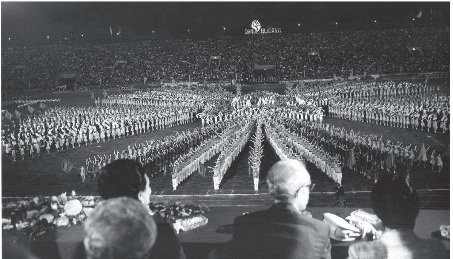
Stadion JNA, 1969. god.