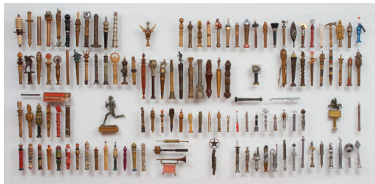
Deo postavke štafeta u Kući cveća