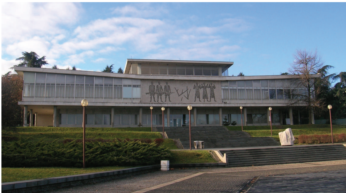
Muzej „25. maj“