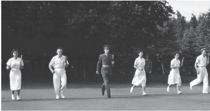
Beli dvor, 1956. god.