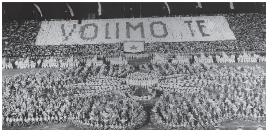
Proslava Dana mladosti, stadion JNA, 1972. god. Celebration of the Youth Day, JNA stadium, 1972