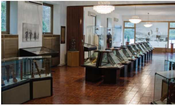
Deo postavke štafeta u Kući cveća