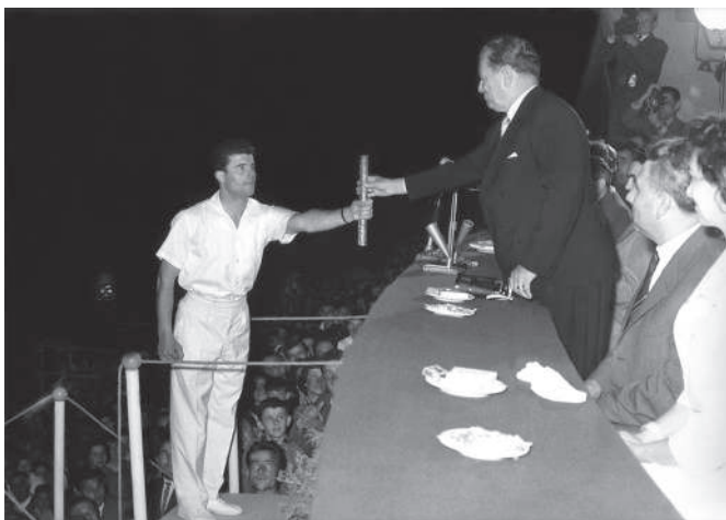
Mile Gavrilov predaje štafetu Josipu Brozu Titu, stadion JNA, 1960. god.

Beogradu, čemu je prethodio svečani doček štafete na Trgu Republike. Koncept je prvi put promenjen 1953. godine kada su, posle predaje, u dvorištu Belog dvora članovi Saveza za telesno vaspitanje „Partizan” izveli program sačinjen od gimnastičkih vežbi, da bi već 1955. godine završna svečanost na dan 25. maja bila preseljena sa Trga Republike na stadion Jugoslovenske narodne armije, odakle su nosioci išli prema Belom dvoru. 7 Sledeće godine na stadion dolazi i Tito izražavajući želju da 25. maj postane smotra mladosti, dan sporta jugoslovenske omladine, dan fizičke i duhovne smotre u koji bi se uklopila i tradicionalna Titova štafeta. Tako Titov rođendan počinje da se proslavlja kao Dan mladosti (bilo je tendencija da se proglaši i državnim praznikom), a Titova štafeta menja naziv u Štafetu mladosti , menjajući i svoj karakter. Umesto više glavnih štafeta, Tito sada na stadionu, posle završenog sleta, prima samo jednu – saveznu štafetu, koja postaje simbol svih ostalih štafeta. 8 Poslednji nosioci su birani