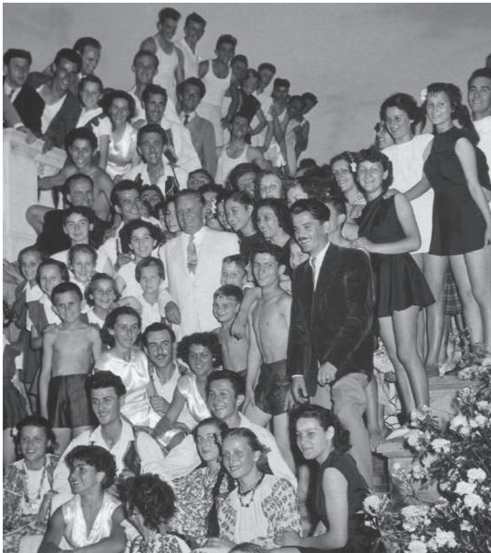
Beli dvor, 1953. god.

U govoru kojim je, 1966. godine, pozdravio predstavnike omladine Tito se osvrnuo na međunacionalne odnose. „Socijalističko društvo ne anulira nacionalnosti, njihovo historijsko porijeklo i dostignuća u prošlosti, ali u socijalizmu moraju da nestanu razne nacionalne nesuglasice. Niko nikoga ne sprečava da kaže da je Hrvat, Slovenac, Makedonac, Srbin,